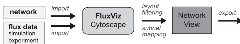
Fig. 1. FluxViz workflow. Network information and flux data can be imported in a variety of formats. A standard NetworkView is generated for the flux distributions in the network context. The NetworkView can be modified by application of layout algorithms, filtering network data, generation of subnetworks based on arbitrary node attributes or flux information and definition of additional visual mappings. The used (flux edge attribute) mapping function can be adapted and additional information like gene expression data can be mapped on visual network attributes. The resulting NetworkViews can be exported in a variety of formats.

can be interactively analyzed in Cytoscape or be exported as images.